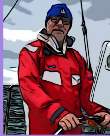
From the Helm

Welcome to 2021 and what can only hope to be a better year than the previous one. So far we have been able to celebrate two special dinners, the last one being our 30 th birthday as a group. The dinner was sold out with a great meal and special tributes as we toasted to continued success and a great future. This was followed by our tradition Birthday Cruise to Royals where we were welcomed and enjoyed the hospitality of our host club on the day. The weather turned out perfect and for those that sailed, a cracking sail home.